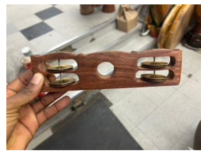
Thumb Shaker $25