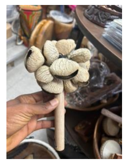
African Rattle $45