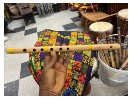
Bamboo Flute $25