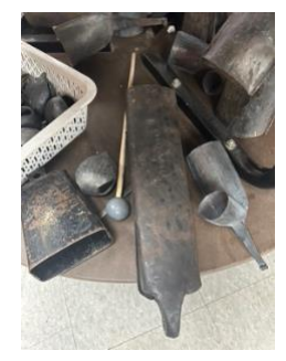
Gonkog Bell $50 - $60