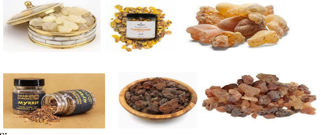
Sizes: Small = $15